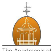
The Apartments at Boot Mills